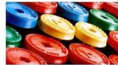
J.P. MORASSE INC.