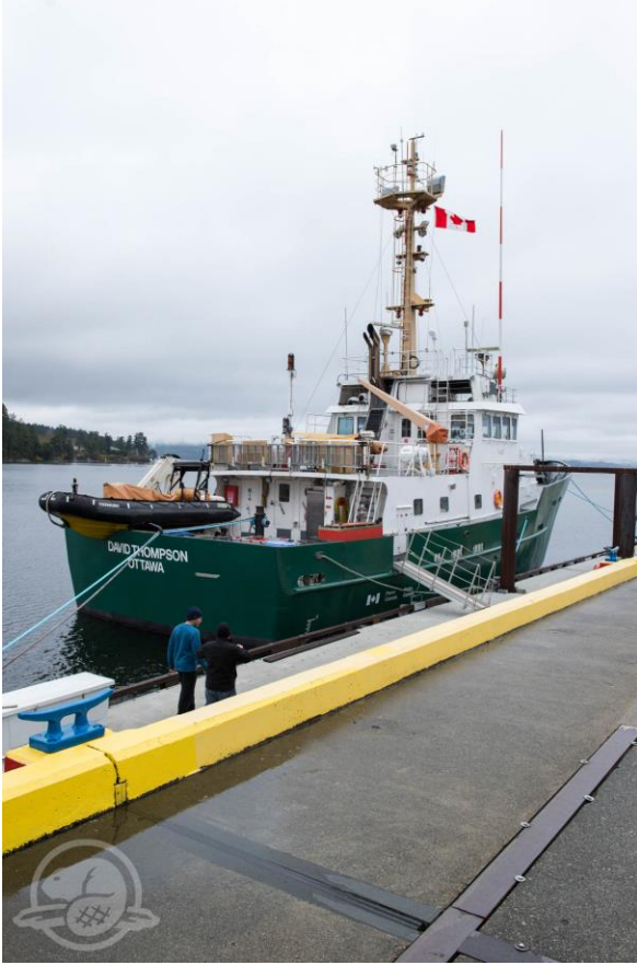
R/V David Thompson

the vessel's multi-beam sonar system will be shared with the Canadian Hydrographic Service for integration within CHS bathymetric data bases. https://www.pc.gc.ca/en/culture/arch/mar-sea/vessel