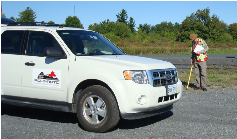
Jim Gunn, Practice Review Manager, on a Field Inspection in Ontario

land being surveyed. Other features within or outside of the land being surveyed may also be shown”. It is helpful to show the proximity to the boundary of any nearby fences, hedges, tree lines, utility poles, driveways and buildings. Civic numbers and road names are also most helpful to Practice Review when conducting field inspections.