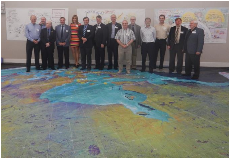
Some of the surveyors who attended the meeting

This workshop has created a huge amount of feedback that the CGCRT will need to review to create an executable strategy or options. What happens next is dependent on how organized and focused the CGCRT steering committee is in completing their interpretation of feedback it received from the more than 100 participants. The CGCRT will soon circulate a final strategy to participants and the public.